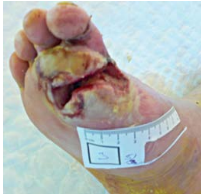
A. Wound at initial presentation

A 74-year-old male with hypertension presented with an infected (limited growth of Morganella morganii and Staphylococcus aureus along with moderate growth of Bacteroides fragilis ) neuropathic wound located on his right foot. After adequate debridement, V.A.C. VeraFlo™ Therapy was initiated using V.A.C. VeraFlo™ Dressing. Lactated Ringer's Solution (10mL) was instilled, followed by a soak time of 15 minutes. Instillation was repeated every 3.5 hours, followed by continuous negative pressure at -125 mmHg for 9 days. No complications occurred during therapy, and granulation tissue was present with no signs of infection based on clinical and culture results. The wound was then treated with V.A.C.® Therapy.