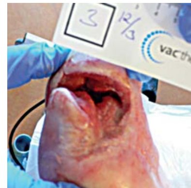
D. Third dressing change