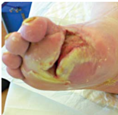
C. Second dressing change